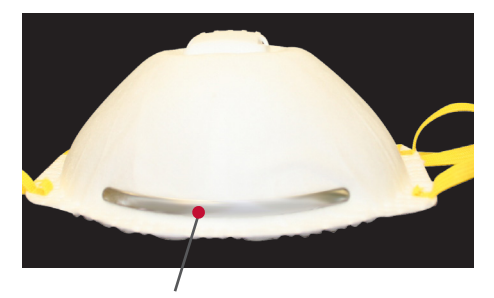
Adjustable aluminum nose bridge for a more secure fit