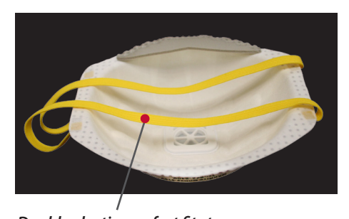
Double elastic comfort fit straps